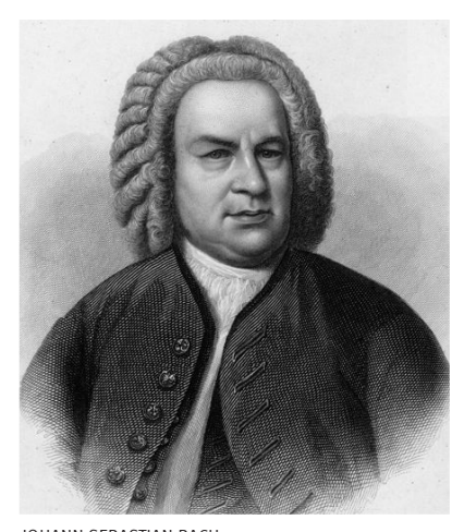
JOHANN SEBASTIAN BACH

Frederick's court. In contrast to the granite columns of the fugues from The Well-tempered Clavier , then, this is music of pink marble and pastel-coloured stucco. These qualities have caused some scholars to consider it as the pianoforte improvisation from that fateful day in Potsdam. The six-part ricercar is anything but a mockery (though it too has some faint galant features); rather, it offers a vision of eternity that is inexplicable in its scope and overwhelming tension between consonance and dissonance. It